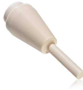
Float bodies in FRIALIT F99.7 for flow monitoring in the chemical industry