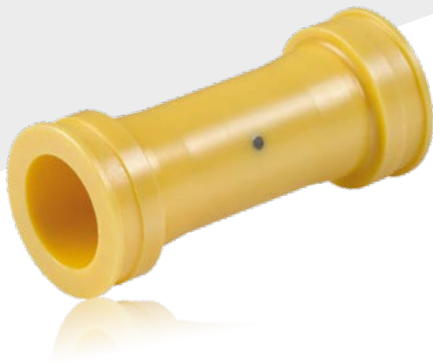
Flow meters in FRIALIT FZM for the food processing industry

Components for highest pressure requirements.