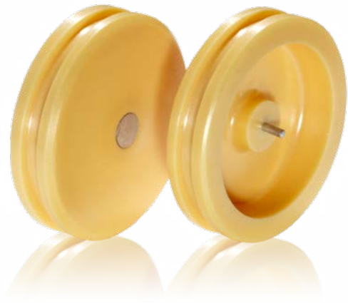
Electrode support made of FRIALIT FZM used to measure levels in the chemical industry