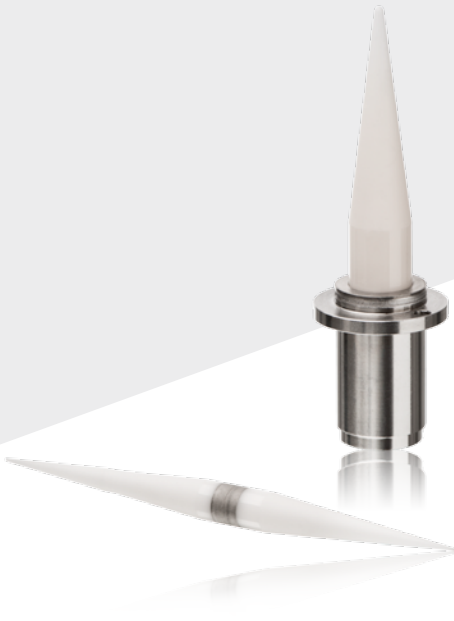
Level sensor made of FRIALIT F99.7

Highest corrosion resistance even in aggressive media.