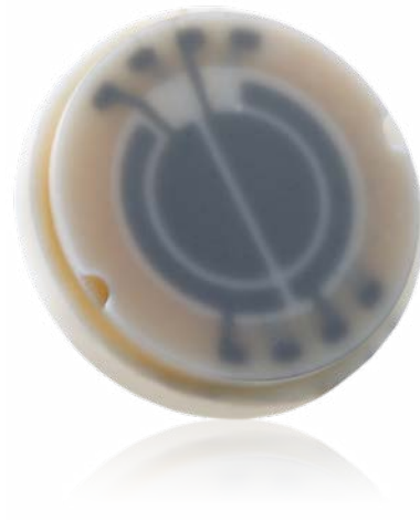
Pressure sensor made of FRIALIT F99.7 for the aerospace industry